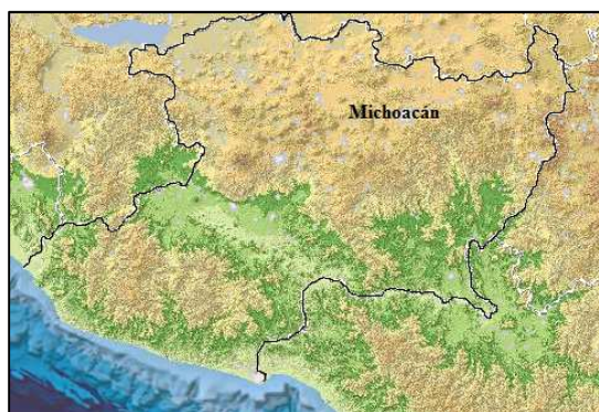
Figure 3: Satellite image of Michoacán

According to the data provided by the office of CONAFOR in Michoacán, only 27 municipalities were involved in the Program until 2010, although the eligible area is located in a total of 65 municipalities (figure 2).