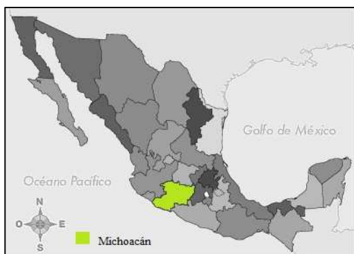
Figure 1: Geographic Location of Michoacán