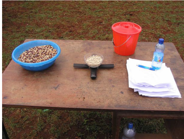
Figure 3: Experimental equipment. Each participant received a flat, blue bucket filled with 2.1 kg of beans in three different colors (700 g of each color), and an empty red bucket (without cover—unlike in the picture). Participants picked beans of one particular color from the blue bucket and dropped them into the red bucket. After time was up, the beans from the red bucket were weighed using a transparent bowl and a scale.