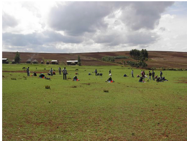
Figure 4: Seating arrangements during the experiment. To allow enough space, the experiment took place outside. Participants sat on the ground in a circle with their backs facing the inside of the circle to ensure that they could not see each other performing the task. Enumerators stood inside the circle.