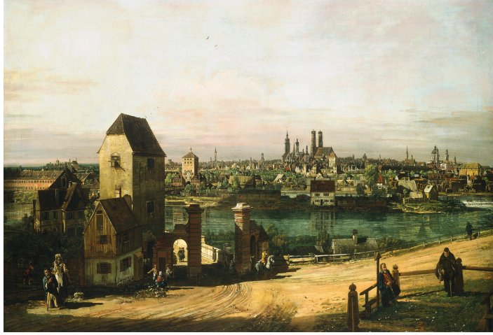
Figure 1: Munich in a 1761 painting by Canaletto

good reason. A young city’s policy is unlikely to be informed by its shape. But for any mature city this seems more difficult to justify. Surely policy adapts much quicker to its surrounding physical structures than these structures do to policy? Once the city has developed its shape – subject not just to early policy but also to numerous other forces of history (e.g. hinterland safety, political institutions, past zoning) and geography (e.g. topography and soil texture) – policy should (also) be expected to follow shape.