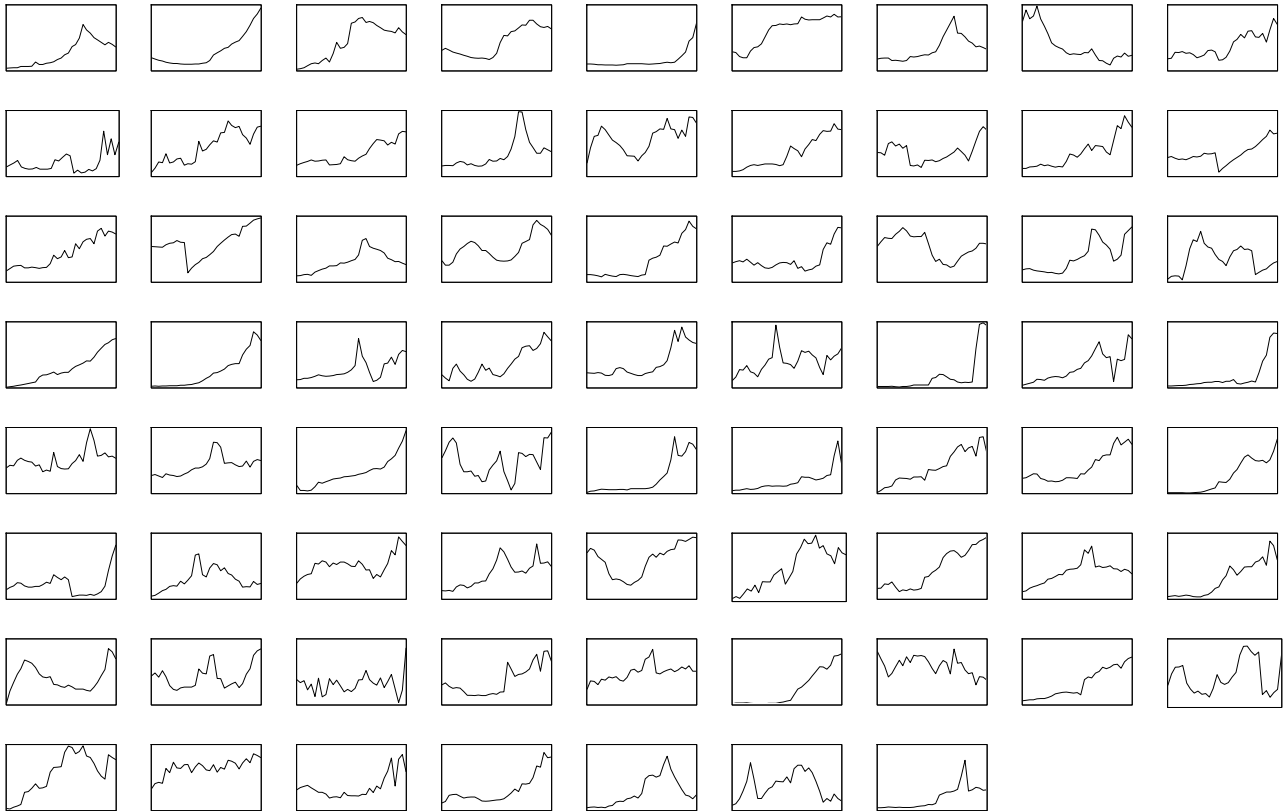
Figure 2. FDI stock as a percentage of GDP by country over the period 1981-2011, (FDI_{it}/GDP_{it})

Notes: The countries from left to right are: Argentina, Bahamas, Bahrain, Bangladesh, Barbados, Benin, Bolivia, Botswana, Brazil, Burkina Faso, Cameroon, Central African Republic, Chad, Chile, Colombia, Dem. Rep. of Congo, Rep. of Congo, Costa Rica, Cote d'Ivoire, Dominican Republic, Ecuador, Egypt, El Salvador, Fiji, Gabon, Ghana, Guatemala, Honduras, India, Indonesia, Jamaica, Jordan, Kenya, Kuwait, Lesotho, Madagascar, Malawi, Malaysia, Maldives, Mali, Mauritania, Mauritius, Mexico, Morocco, Mozambique, Niger, Nigeria, Oman, Pakistan, Panama, Paraguay, Peru, Philippines, Qatar, Saudi Arabia, Senegal, Sierra Leone, South Africa, Sri Lanka, Sudan, Swaziland, Thailand, Togo, Trinidad & Tobago, Tunisia, Turkey, Uruguay, Venezuela, Zambia, and Zimbabwe.