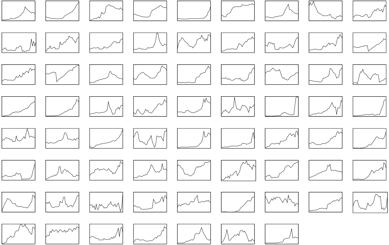
Figure 2. FDI stock as a percentage of GDP by country over the period 1981-2011, (FDI_{it}/GDP_{it})

Notes: The countries from left to right are: Argentina, Bahamas, Bahrain, Bangladesh, Barbados, Benin, Bolivia, Botswana, Brazil, Burkina Faso, Cameroon, Central African Republic, Chad, Chile, Colombia, Dem. Rep. of Congo, Rep. of Congo, Costa Rica, Cote d'Ivoire, Dominican Republic, Ecuador, Egypt, El Salvador, Fiji, Gabon, Ghana, Guatemala, Honduras, India, Indonesia, Jamaica, Jordan, Kenya, Kuwait, Lesotho, Madagascar, Malawi, Malaysia, Maldives, Mali, Mauritania, Mauritius, Mexico, Morocco, Mozambique, Niger, Nigeria, Oman, Pakistan, Panama, Paraguay, Peru, Philippines, Qatar, Saudi Arabia, Senegal, Sierra Leone, South Africa, Sri Lanka, Sudan, Swaziland, Thailand, Togo, Trinidad & Tobago, Tunisia, Turkey, Uruguay, Venezuela, Zambia, and Zimbabwe.