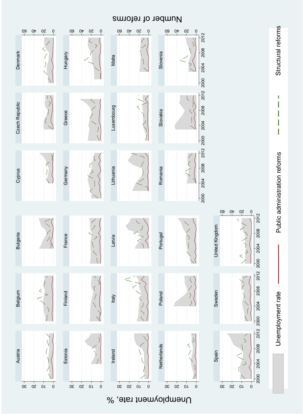
Figure 2: Unemployment and the frequency of public administration and other reforms by year and country