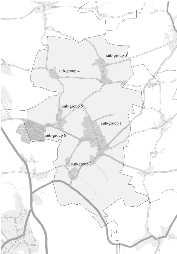
Figure 3: Identification of sub-groups in municipalities

Our measure for the dominant group’s absolute size is then simply the number of eligible voters in the largest disentangled residential area within the municipality. Given data constraints, we approximate this by multiplying the share of the largest residential area in the total municipal area with the total municipal population. Its relative size is