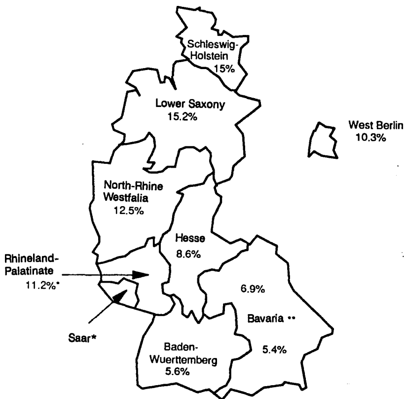
Figure 1 Regional differences in youth unemployment*** in the Federal Republic of Germany (1985)

* Rhineland-Palatinate unemployment data include the Saar.