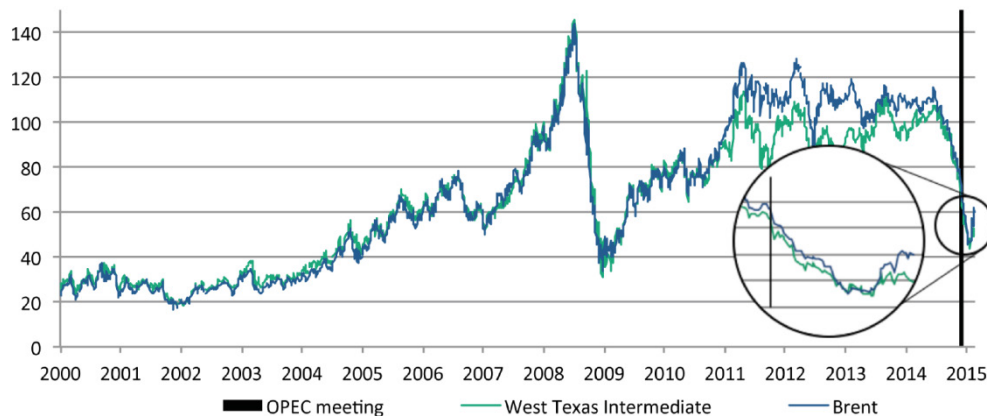
Figure 1: Daily crude oil price, West Texas Intermediate (WTI) and Brent, in nominal USD/bbl; the OPEC meeting on Nov 27, 2014, is marked for illustration