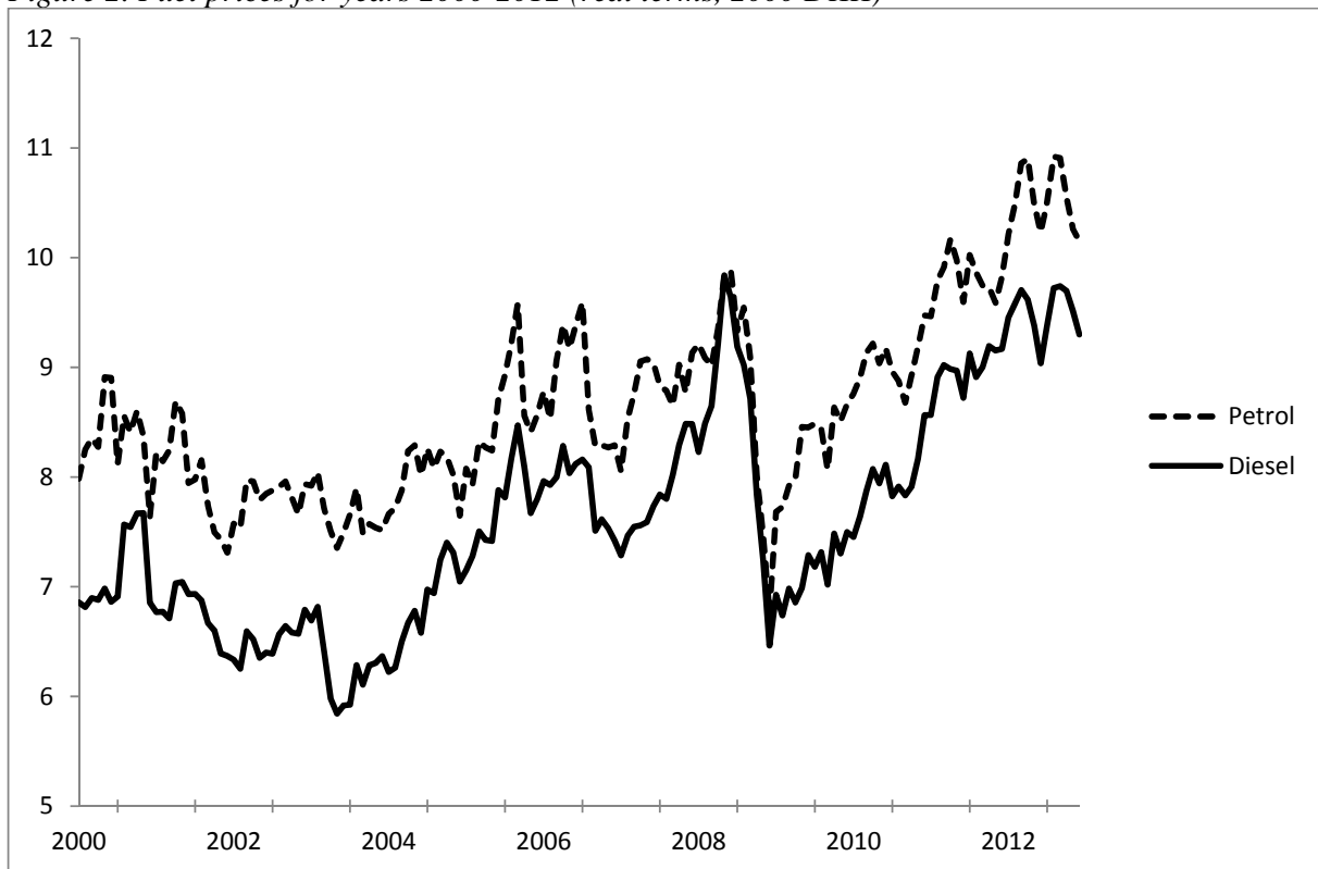
Figure 2. Fuel prices for years 2000-2012 (real terms, 2000 DKK)

Fuel prices are from The Danish Petroleum Association web page ( http://oliebranchen.dk/da-DK/Service/English.aspx ); they are also averaged over the interval between MOT-tests. Figure 2 shows the evolution of real fuel prices for the period 2000-2012. The car's fuel efficiency is derived from annual register data from Statistics Denmark. The specific (brand/model/make) car's fuel efficiency provided in the annual register data is based on the New European Driving Cycle (NEDC); this is a driving cycle designed to assess the emission levels of car engines and fuel economy in passenger cars (excluding light trucks and commercial vehicles) 12 .