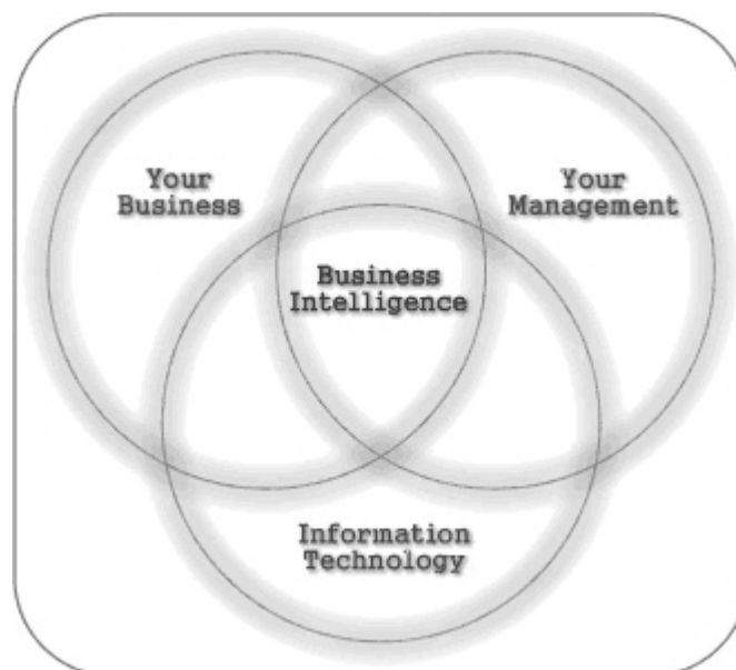
The analysis of Business Intelligence

Business Intelligence is not a set of printed reports or an presentation on a screen [6]. The rows of a sales report, for example, may contain detailed information and accurate, but is not a Business Intelligence solution until they are put into a format that can be easily understood and interpreted by a person in order to establish an effective solution for a particular situation encountered in the day-to-day process by agricultural companies or any other type of companies.