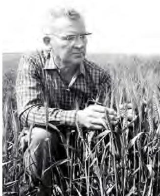
Fig. 2. Orville Vogel (picture in the public domain)

Cecil Salmon (1885–1975), an American biologist working in post-World War II Japan, collected 16 varieties of wheat, including one called “Norin 10”, which was very short, thus less likely to suffer wind damage. Salmon sent it to the American agronomist Orville Vogel (1907–1991) – fig. 2 in Washington in 1949. Vogel began crossing Norin 10 with other wheats to make new short-strawed varieties. Vogel led the team that developed Gaines, the first of several new varieties that produced 25 percent higher yields than the varieties they replaced. Vogel shared his germplasm with Norman Borlaug, who later received the 1970 Nobel Peace Prize for his role in the “green revolution.” Borlaug publicly acknowledged Vogel’s contributions to his research [2].