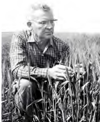
Fig. 2. Orville Vogel (picture in the public domain)

Cecil Salmon (1885–1975), an American biologist working in post-World War II Japan, collected 16 varieties of wheat, including one called “Norin 10”, which was very short, thus less likely to suffer wind damage. Salmon sent it to the American agronomist Orville Vogel (1907–1991) – fig. 2 in Washington in 1949. Vogel began crossing Norin 10 with other wheats to make new short-strawed varieties. Vogel led the team that developed Gaines, the first of several new varieties that produced 25 percent higher yields than the varieties they replaced. Vogel shared his germplasm with Norman Borlaug, who later received the 1970 Nobel Peace Prize for his role in the “green revolution.” Borlaug publicly acknowledged Vogel’s contributions to his research [2].