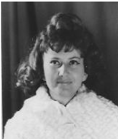
Fig. 3. Zoe Țapu (picture in the public domain)

(through heterosis), [3] between 1967 and 1989, the Romanian agronomist Zoe Țapu (1934–2013) – fig. 3 , working at the National Agricultural Research and Development Institute in Fundulea, developed a research program for improving winter durum wheat, in order to obtain cultivars with fall resistance and high yield, using height-reduction genes from summer durum developed at the International Maize and Wheat Improvement Center (CIMMYT) in Mexico [4][5][6].