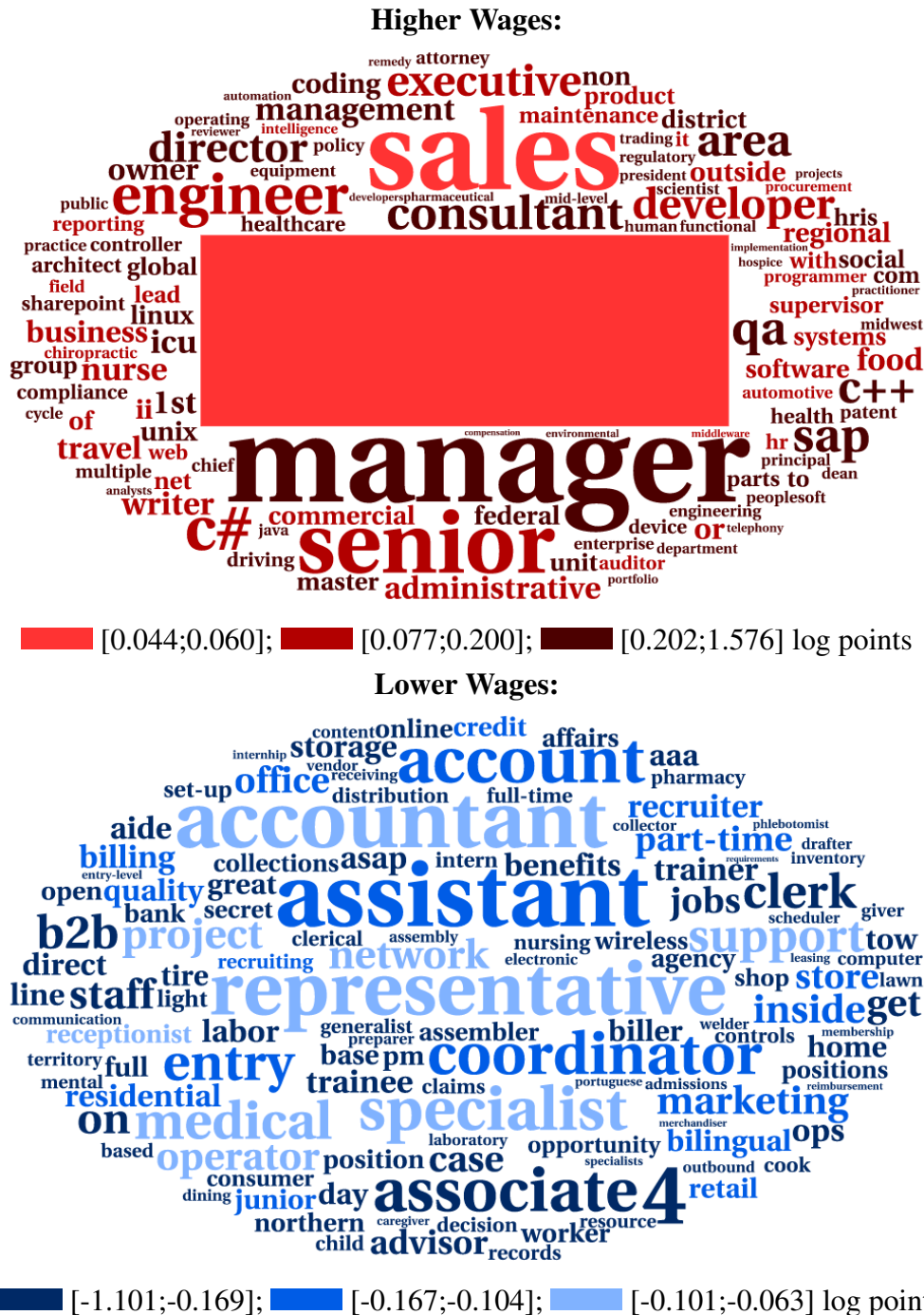
Figure 3: Words that predict wages within a given SOC code

Note: Words that are significant at the 5% level in explaining the residuals after a regression of the posted wage on SOC codes fixed effects (Table 6, column II) and appear at least 10 times. The big rectangle is "-", which typically separates the main job title from additional details. Word cloud created using www.tagul.com . The size of a word represents its frequency, while the color represents the tercile of its coefficient, weighted by frequency.