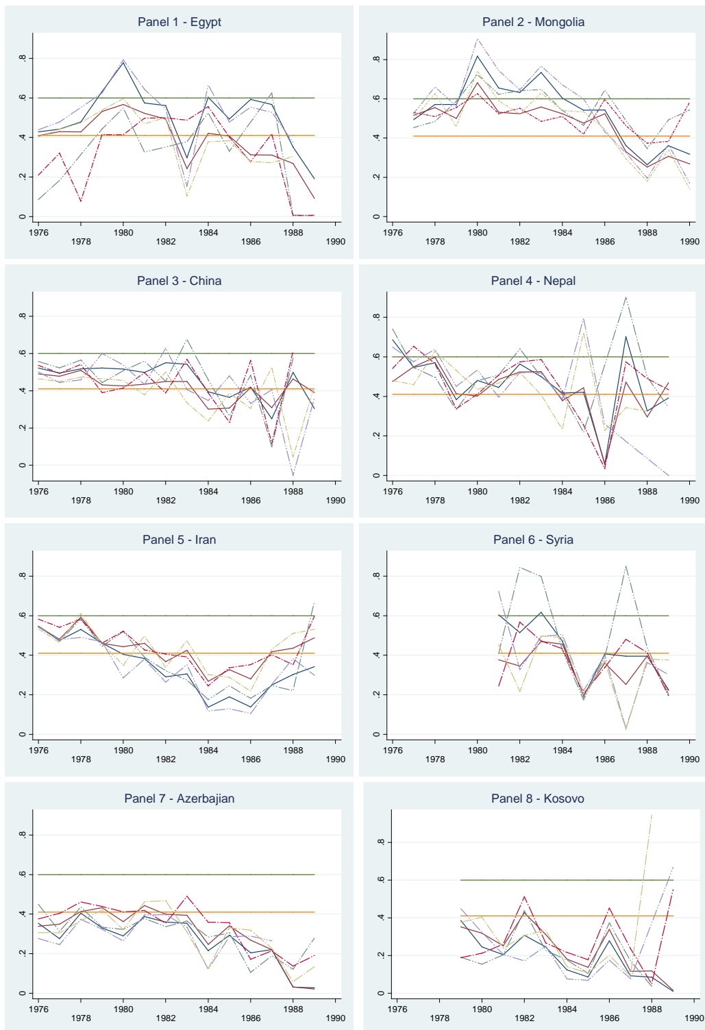
Figure 1: Intergenerational educational regression coefficients and correlations