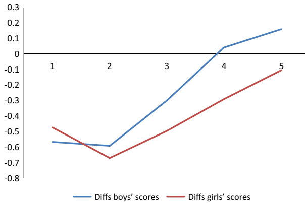
Fig. 2 Differences between treated and untreated boys' and girls' scores

Table 13 shows a cost–benefit comparison with other programs aimed at improving education in underdeveloped countries, including an estimate of the cost effectiveness of the program analyzed in this paper. The remedial program analyzed in this paper is more than eight times more cost effective than the teacher incentives program evaluated by McEwan and Santibañez (2005), and four times less cost effective than the remedial program evaluated by Banerjee et al. (2004).