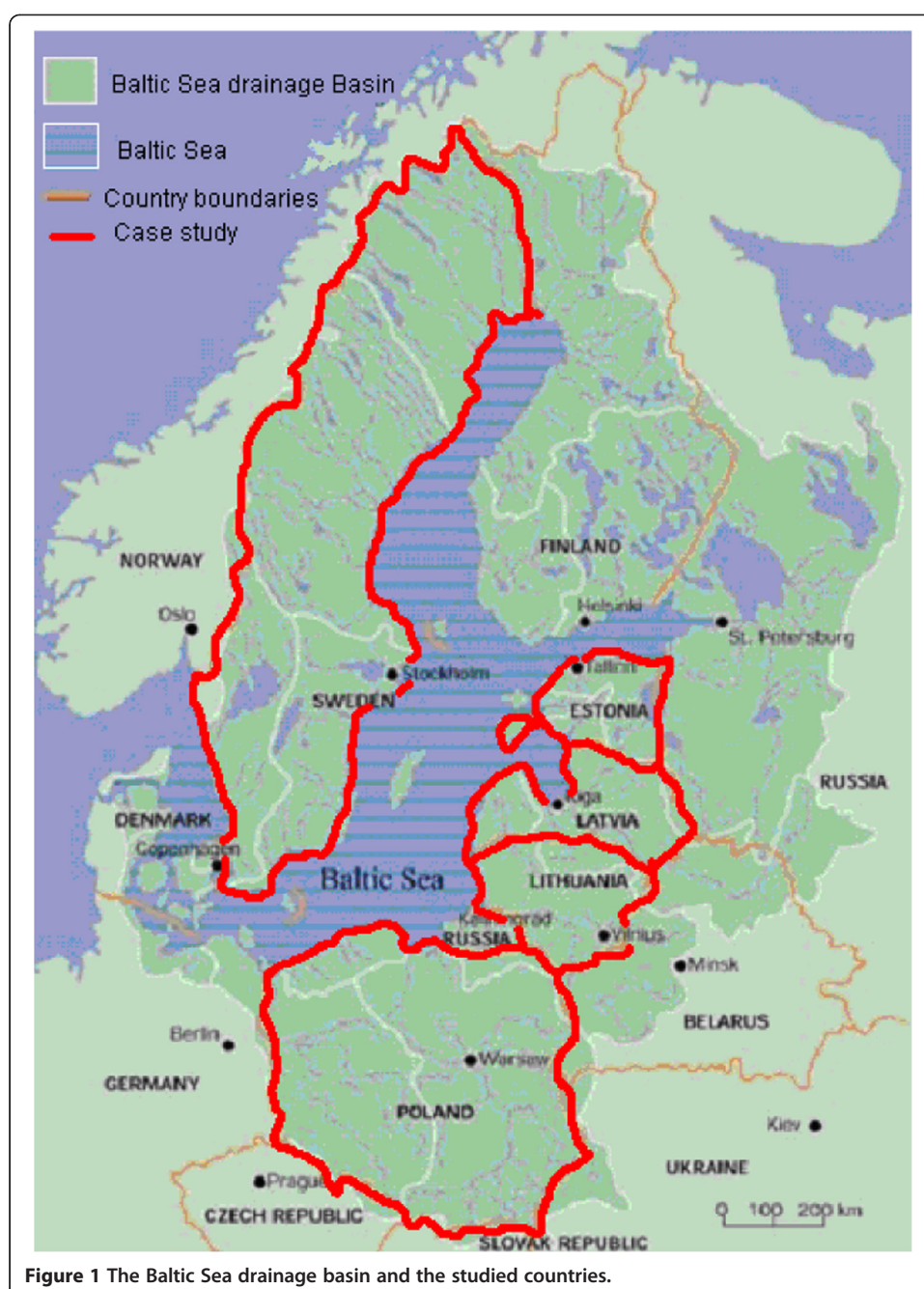
Figure 1 The Baltic Sea drainage basin and the studied countries.

constraint encountered with personal communication was that some respondents did not have good enough knowledge of English to answer all the questions. The first respondents that were contacted were singled out from the literature review or from lists of participants in organic agriculture seminars and workshops. A subsequent 'snowball' effect led to further people being identified (Schultz et al. 2007; Sandström 2008). Since some respondents had a vested interest in the promotion of organic farming, a possible bias in their responses should be noted. In all, ten senior officials or researchers from Poland, the three Baltic countries and regional organisations answered the questionnaire. Even though the number of respondents was limited, the questionnaire provides