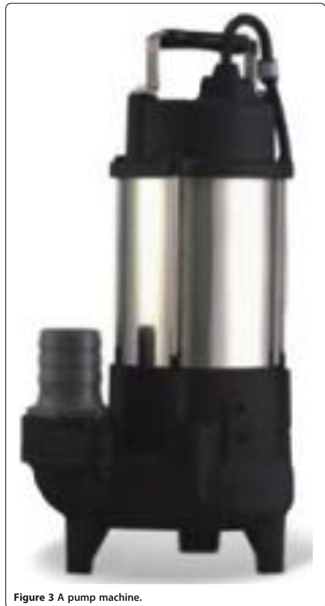
Figure 3 A pump machine.

The mechanical brush will only remove the soil, and the solvent will both dissolve the grease and rinse away the soil. Thus, it is more appropriate to use the chemical