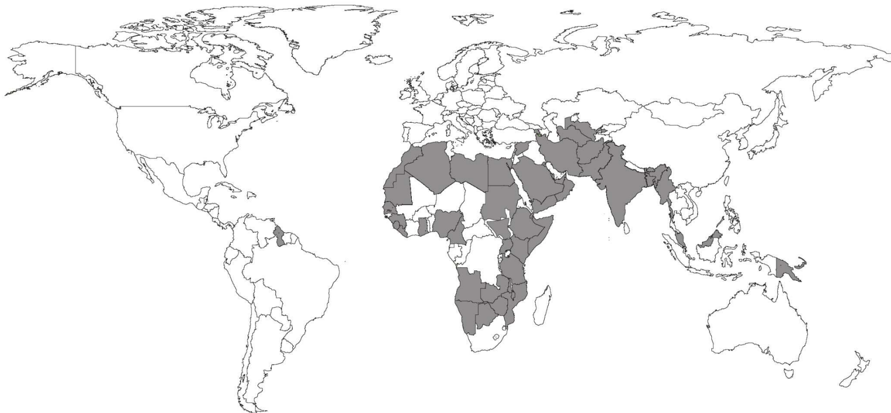
Figure 1. Legal Status of Homosexuality in the World in 2013

Note: countries marked grey criminalize sexual conducts between people of the same sex in 2013.