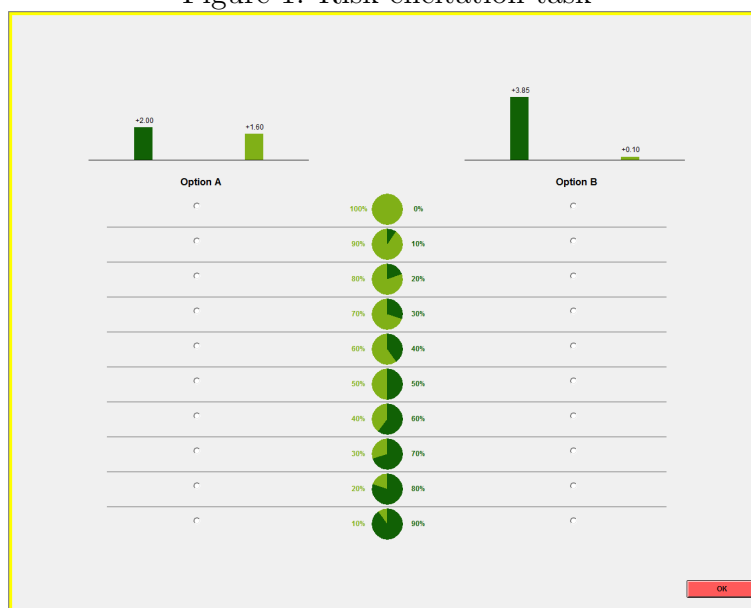
Figure 1: Risk elicitation task

In the second and main part of the experiment every subject was randomly paired with a co-worker. Each pair undertook an effort task ( work task ) that determined the workers' wages. Thereafter, each worker faced a risky decision that could generate a bonus ( bonus task ).