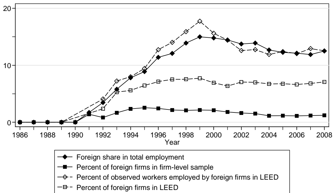
Figure 1: Evolution of the Share of Foreign Acquisitions, Firm-Level Data and LEED

Notes: N = 2,475,478 worker-years for the LEED sample and 1,881,267 firm-years for the firms sample. Sample consists of domestic firms and previously domestic firms that have been acquired by a foreign owner. Percent foreign firms = percent of firms majority foreign owned. Foreign share in total employment = percentage of employees employed by majority-foreign owned firms. LEED = Linked Employer-Employee Data.