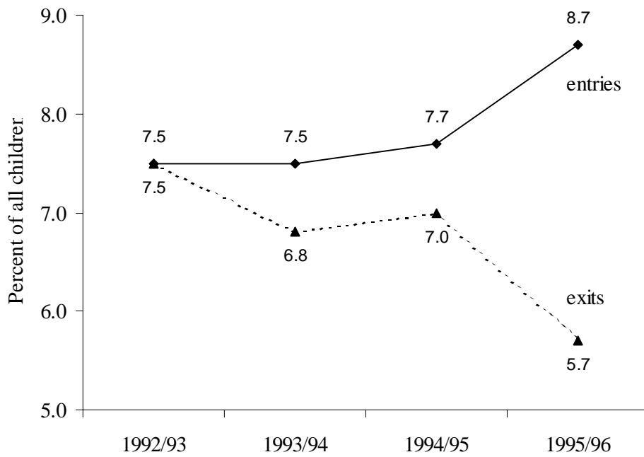
Figure 3: Children entering and leaving poverty as a percent of all children

Note: The figures are percentages of all children present in each pair of waves.