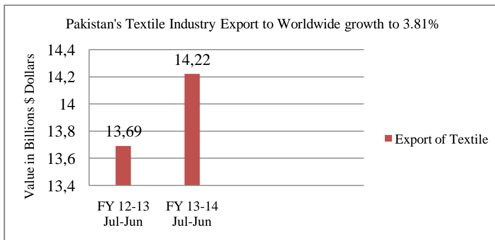
Figure 1: Caption of figure

growth of 21.4% judged against to $2.894bn in the similar stage of earlier 2013 year.