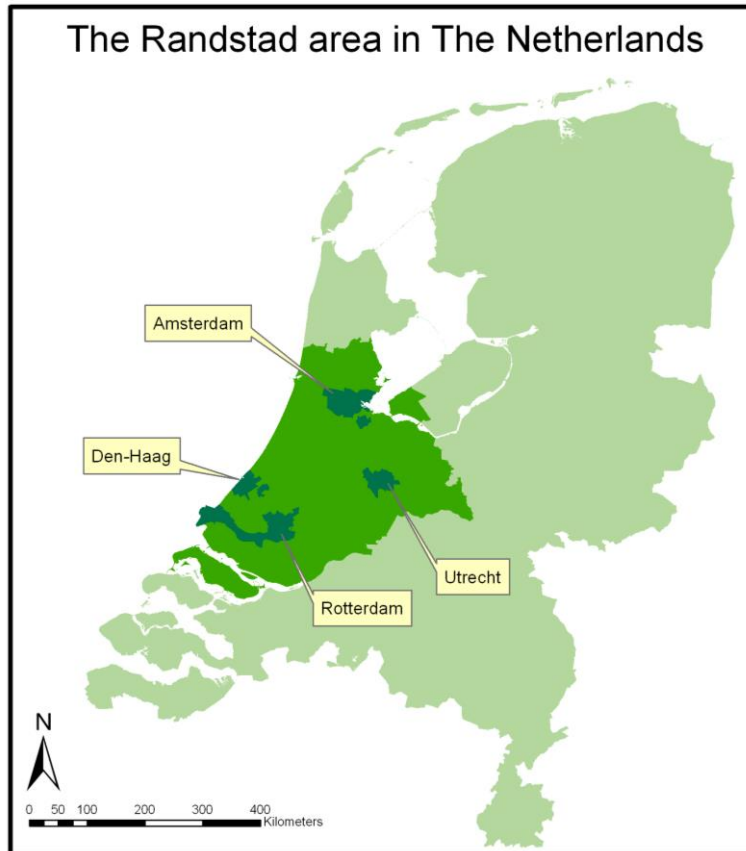
Figure 1 - The Randstad study area within the Netherlands.