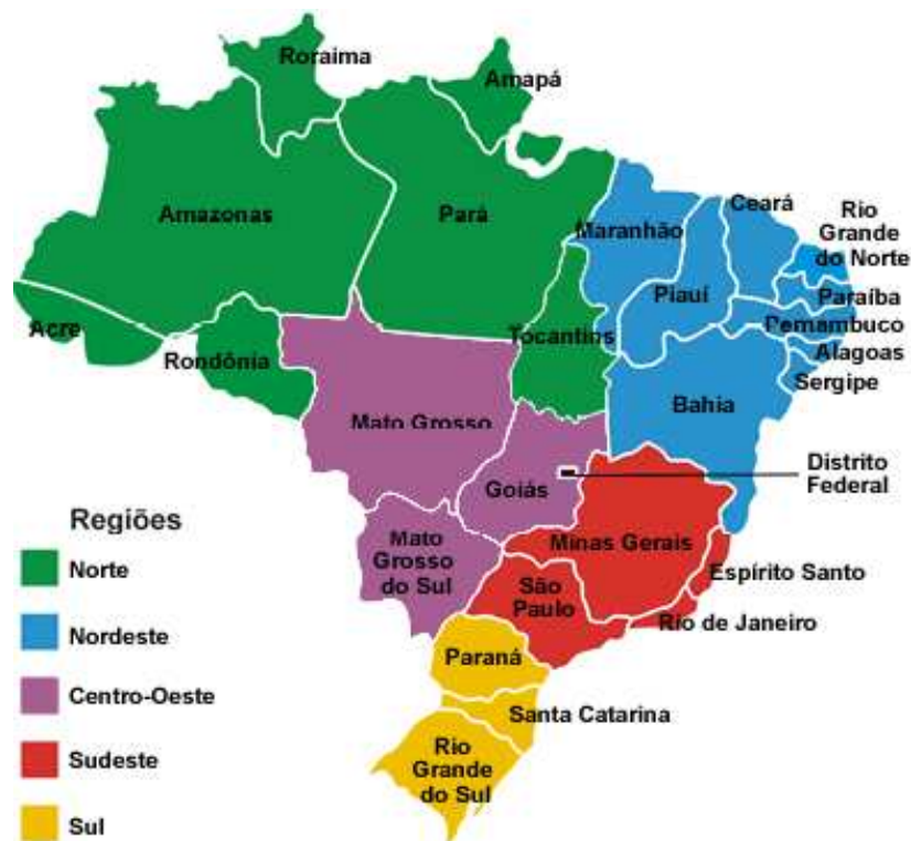
Figure A-1: Map of Brazil