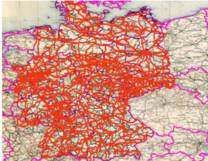
FIGURE 1.— Digitized railroad network from 1890 within NUTS 1 and NUTS 3 boundaries of 2008

Notes: Source for the original: Geogr. lith. Inst. u. Steindr. v. W. Greve, Kgl. Hoflith, 13. 1890/1, Deutsche Bahn Museum. The total length of the digitized net is 28,536 km.