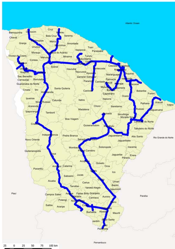
Figure 1: CDC State Network

In densely populated urban areas, Metro-Ethernet technology is used, with speeds of 1 and 10 Gbps. In the capital Fortaleza, a GPON (Gigabit Passive Optical Network) network is used for 811 subscriber points, including schools. It is worth noting that in 55 municipalities there are towers with point-multipoint radio, using WiMAX (IEEE 802.16) in the 3.5 and 4.9 Ghz frequencies, with the latter being used only for public safety and rescue services. All the Personal Mobile Radio (PMR) services of the state police utilize the fiber optic infrastructure of the CDC, through the technology Terrestrial Trunked Radio (“TETRAPOL”) over IP. Five thousand portable and vehicle-based terminals have been installed in the TETRAPOL network.