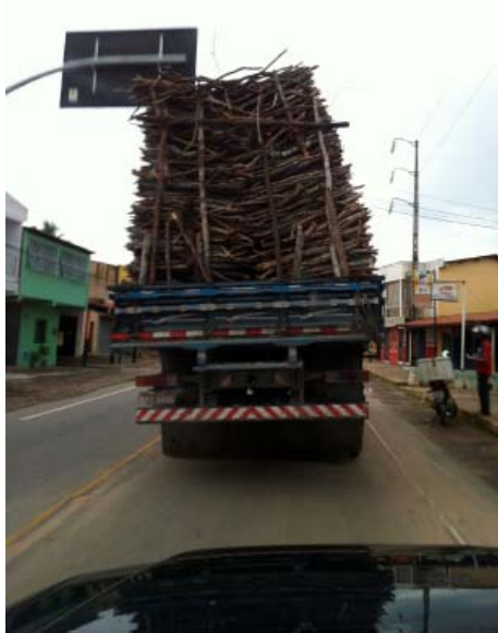
Figure 3: Overloaded Trucks Can Cause Cable Breaks

the cable did not contain any metal, there was a significant reduction of cable breaks. Today, there is less than one cable rupture per year attributed to theft. 16 Nowadays, the highest frequency of cable ruptures occurs where cables cross highways, primarily because of overloaded trucks.