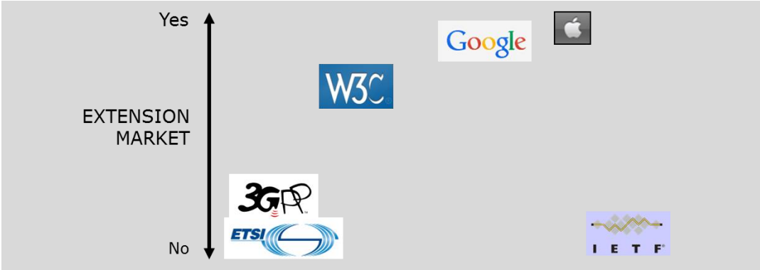
Figure 2 SSOs and private platforms, and assessment of standard openness

The variance between the cases for the variable Extension markets takes another pattern than for Standard governance. This means that the presence of an Extension market can be combined with either of the extremes of Standard governance.