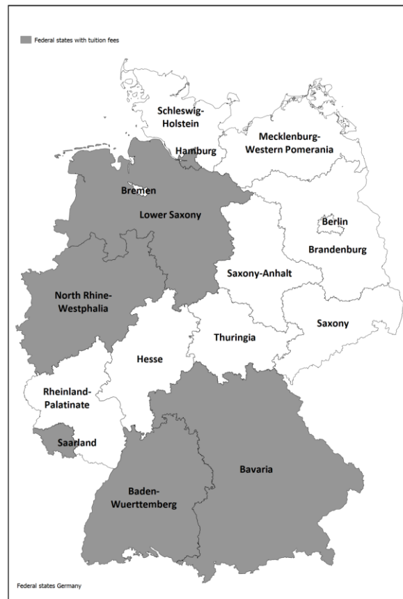
Figure 1: German Federal States Charging Tuition Fees in 2009

Since our data provide information about the treatment and control group before and after the reform, a difference-in-differences approach can be applied. A number of empirical studies have used the same identification strategy for the evaluation of the effects of tuition fees on other outcomes, and have proven that the introduction of tuition fees in some of the German federal states provides a reasonable institutional setting for this estimation approach (e.g. Dwenger et al., 2012, Hübner, 2012, Bruckmeier and Wigger, 2013, Helbig et al., 2012). However, although the change in