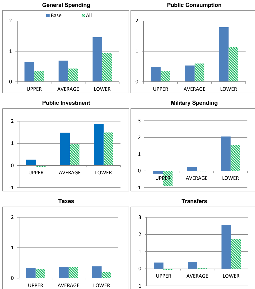
Figure 2: Compound cumulative multipliers of fiscal impulses for different regimes – Full sample. (Baseline specification: blue-bold bars, based on column (1) of Table 4. Specification with all possible interactions: green-striped bars, based on column (2) of Table 4)