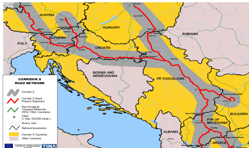
Figure 2. Corridor 10 – Road-railway corridor

For us, the reconstruction and, particularly, development of transport activity on Corridor 10 are rather significant, particularly because of the following (Jovanovic, Cvetanovic, and Zaric 1999):