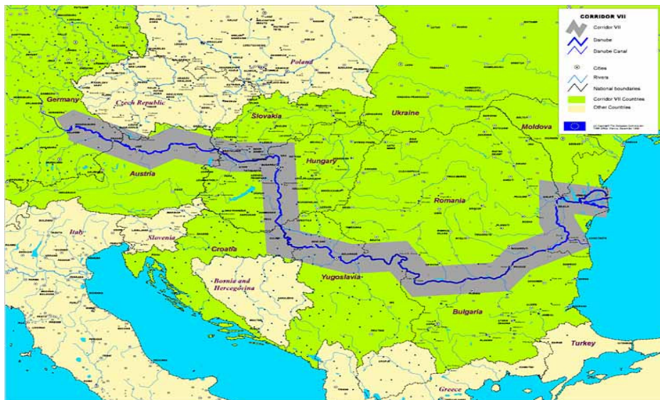
Figure 1. Corridor 7 – Water Corridor

Water Corridor or Corridor 7 is one of the most important European roads, and along with Rhine and Maine it is the most important waterway on the Continent. Basically, it consists of the river Danube, in the length of 2845 km. The most important ports on this corridor are: Ulm, Regensburg, Passau, Linz, Vienna, Bratislava, Budapest, Novi Sad, Belgrade, Vidin, Rousse, Giurgiu, Braila, Galati and IZmail. Corridor 7 is a part of TEN-T (Trans-European Network for Transport), which consists of networks of roads, railways, river roads and ports, seaports and airports throughout the EU with neighbouring countries and yet non-existent connectors. Projects that should support this network are encouraged by the member countries of EU. Priority are the observation of the existence of “bottlenecks” and organization of projects by which they would be removed, particularly on the Danube, key waterway in TEN-T (Danube Strategy in Serbia).