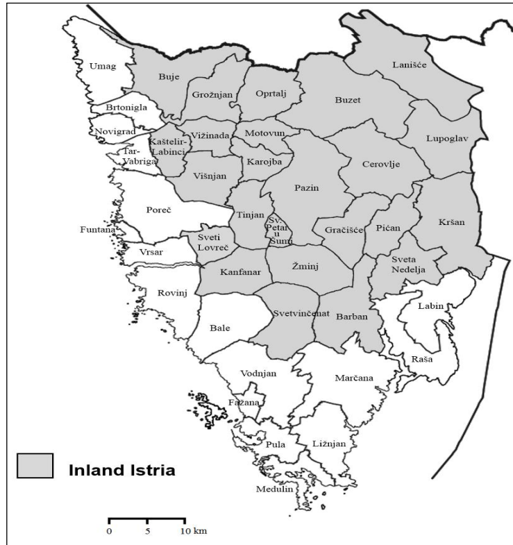
Figure 1. Administrative and territorial division of Istria County (After the cartographic basis of the Institute for Physical Planning of Istria County, 2001, by the Authors)

By analysing quantitative and qualitative indicators, the aim of the study was to identify the economic aspect of shaping the interior of Istria into a region of sustainable tourism. In addition, the studied aimed to determine the extent to which tourism is established in municipalities and towns as a relatively recent spatial-economic factor.