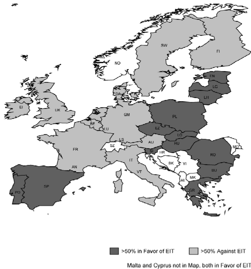
Figure 1: Winners and Losers from a Centralized European Income Tax for the 27 EU Member States

Figure 1 highlights the winners and losers from an EIT. The countries in light grey are those in which the resident at the 50th percentile loses from an EIT compared to the decentralized solution. Since the resident at the 50th percentile is the median voter, we argue that the countries whose median voter loses from an EIT are against an EIT and the countries whose median voter wins are in favor of an EIT. The countries in dark grey are in favor of the EIT. According to our simulation, 15 countries would vote for an EIT, including Portugal, Romanian and Slovakia, while 12 countries would vote against an EIT, including Denmark, France and Germany. Therefore, by the current rules for the reform in fiscal matters, an EIT cannot be passed as it requires unanimity. This result is not really surprising: since a large part of inequality in the EU exists between countries, there are certainly countries which would lose from an EU-wide redistribution and would thus be against it.