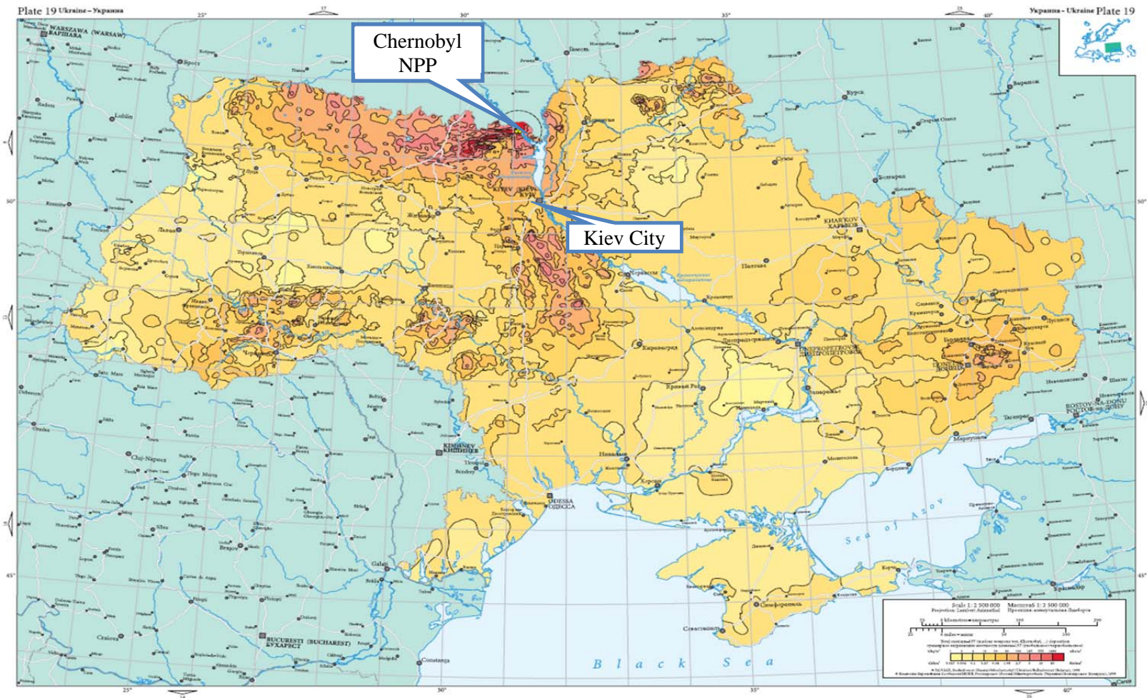
Fig. A-1: Regional variation of total caesium-137 deposition in 1986 in Ukraine

Notes: Darker red areas indicate higher radiation levels.