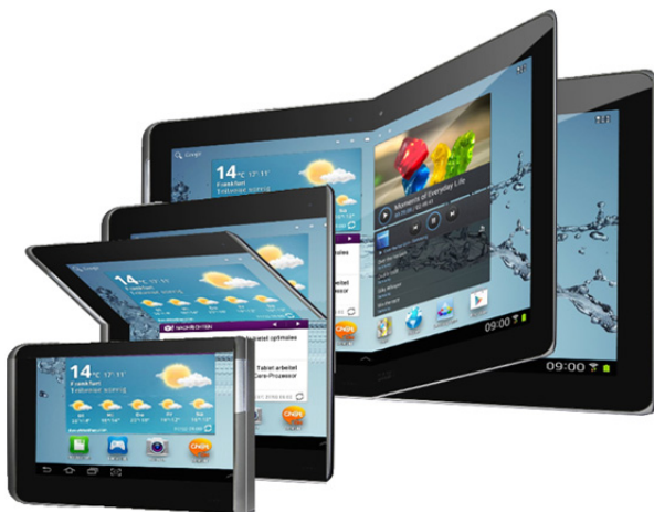
Figure 2: The hypothetical “Pivotablet” with hinged 4.5”, 7”, and 10” screen

The survey itself had a design with 2 version \times 2 stated preference methods. The C/V method was explained to the participants, and the “Pivotablet” was introduced as the underlying product. A photograph (Figure 2) was shown, and a short description explained the advantages of the new innovation.