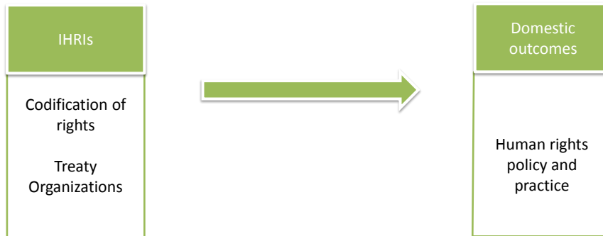
Figure B Indirect & conditional effects