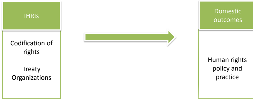
Figure B Indirect & conditional effects