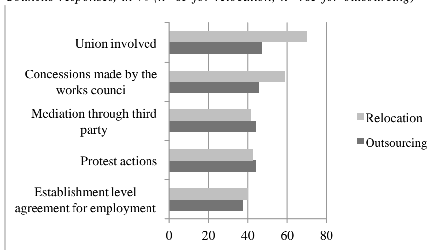
Figure 4. Activities of the works council vis-à-vis relocation and outsourcing strategies. Works Councils responses, in % (n=83 for relocation; n=485 for outsourcing)