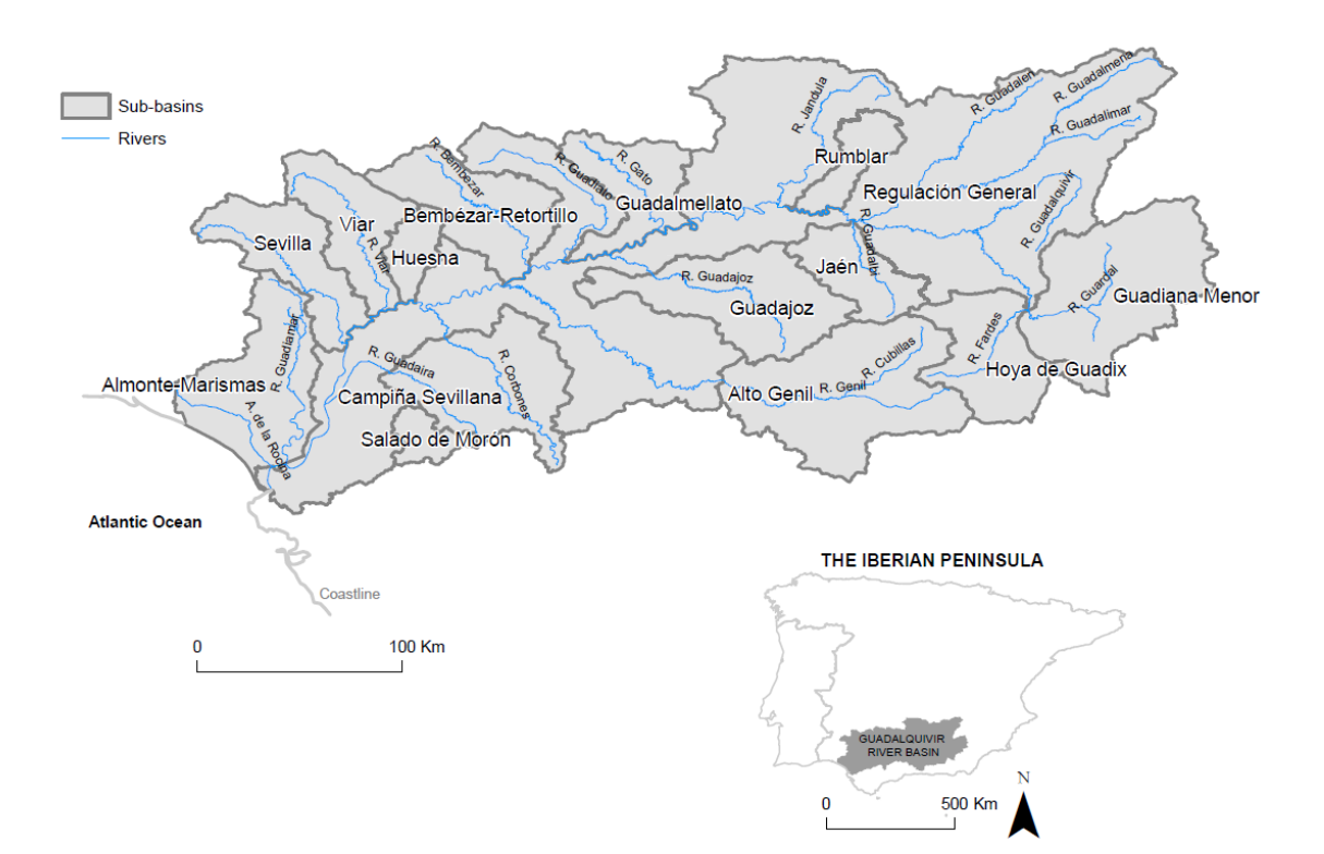
Figure 1: Location of the Guadalquivir River Basin in the Iberian Peninsula and detail of its subbasins.