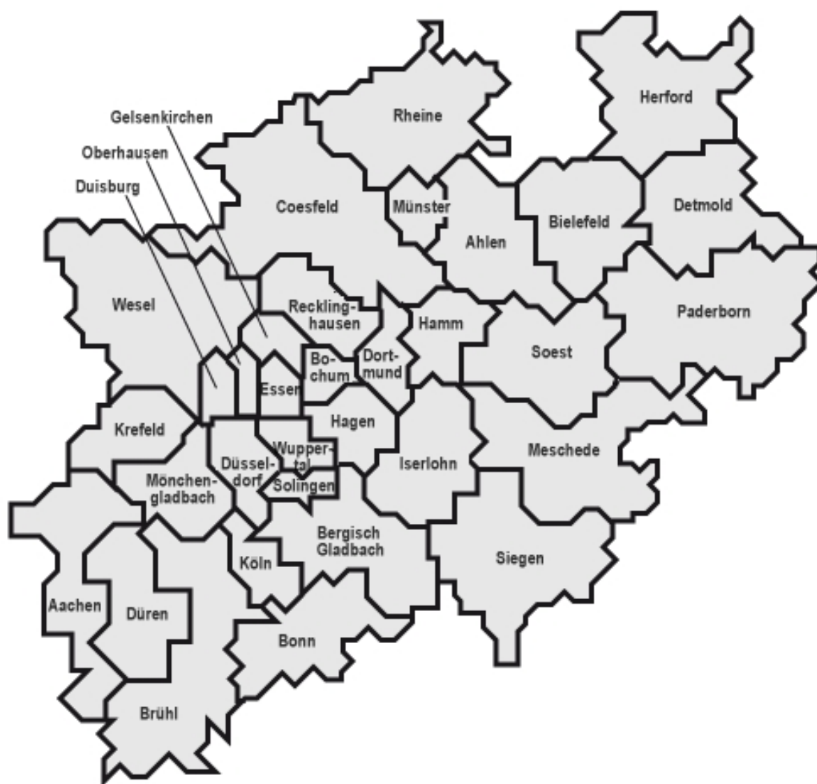
Figure 3: Labour market policy districts in North-Rhine Westfalia. Districts used in estimation: Bochum, Dortmund, Düsseldorf, Duisburg, Essen, Gelsenkirchen, Hagen, Oberhausen, Recklinghausen, Solingen, Wuppertal. As of 25/07/2012. Source: Bundesagentur für Arbeit