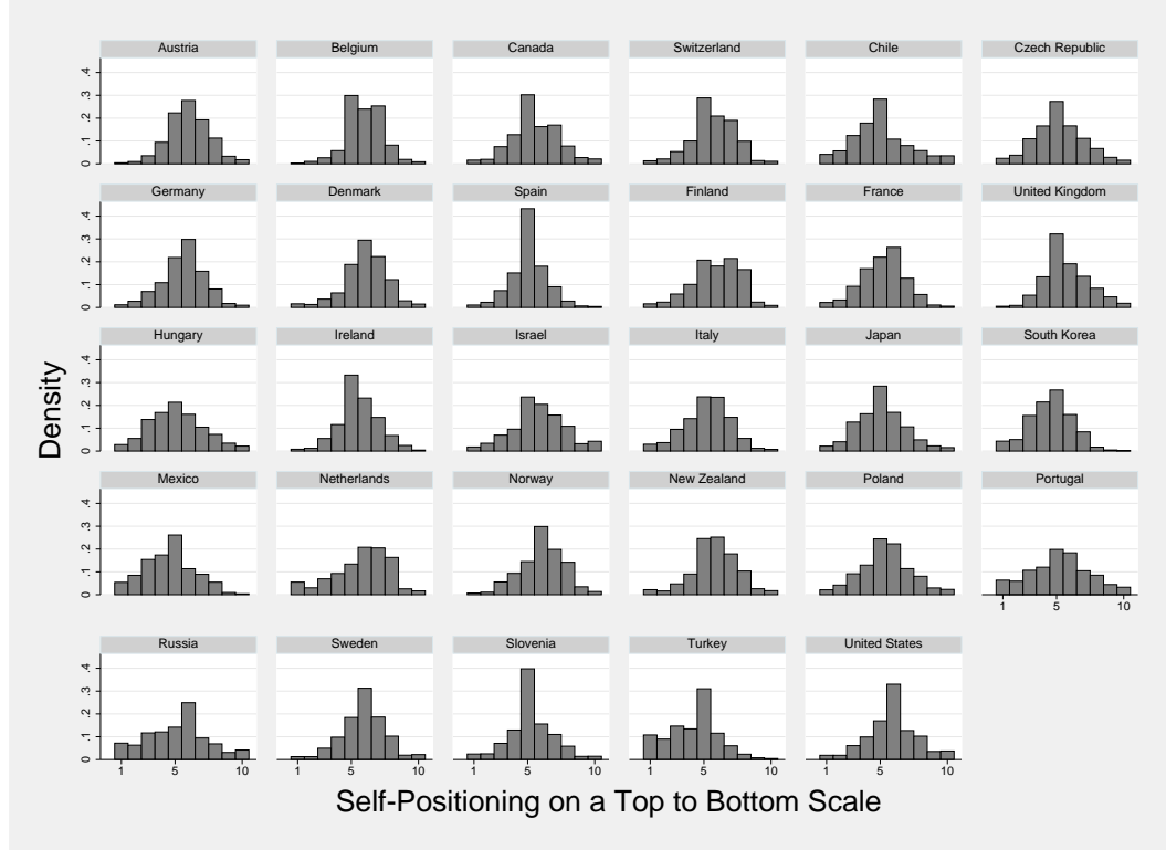
Figure 1: Generated income distribution by country.

To make sure, the hypothetical income distributions in Figure 1 are based on the aggregation of individual and categorical data. Thus, they are not perceptions of the income distribution that any specific individual in society holds but rather a summary view on how society categorizes itself with respect to inequality.