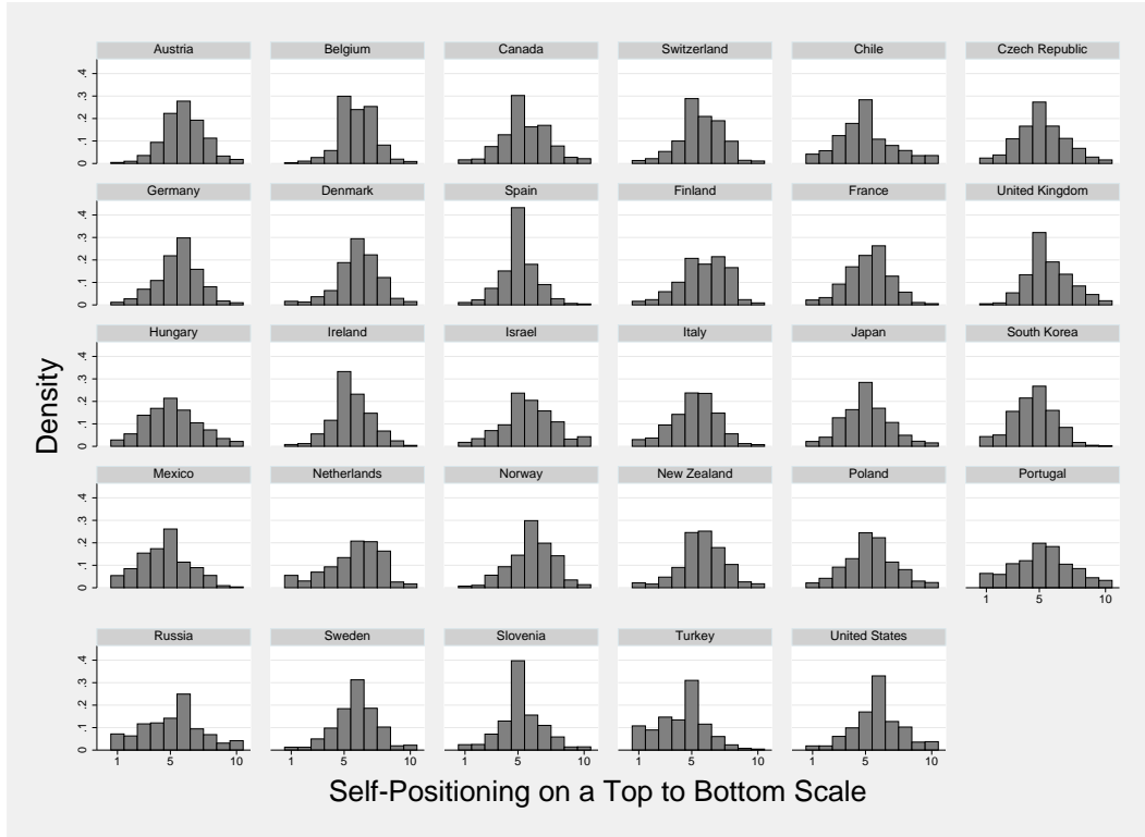
Figure 1: Generated income distribution by country.

To make sure, the hypothetical income distributions in Figure 1 are based on the aggregation of individual and categorical data. Thus, they are not perceptions of the income distribution that any specific individual in society holds but rather a summary view on how society categorizes itself with respect to inequality.