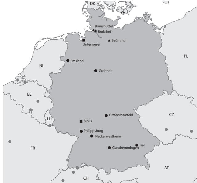
FIG. 1: Nuclear power plant sites in and close to Germany, March 2011

Note: Foreign nuclear power plant (NPP) sites are marked by grey dots and without name. German NPP sites are marked by black dots, triangles, or squares and with name. Black dots indicate operating NPP sites that were not (fully) closed after Fukushima (Brokdorf, Emsland, Grohnde, Grafenrheinfeld, Philippsburg, Neckarwestheim, Gundremmingen, and Isar), black squares indicate operating NPP sites that were (fully) closed after Fukushima (Unterweser, Biblis), and black triangles indicate non-operating NPPs at the time of the Fukushima accident (Brunsbüttel, Krümmel), all of which were closed after Fukushima.