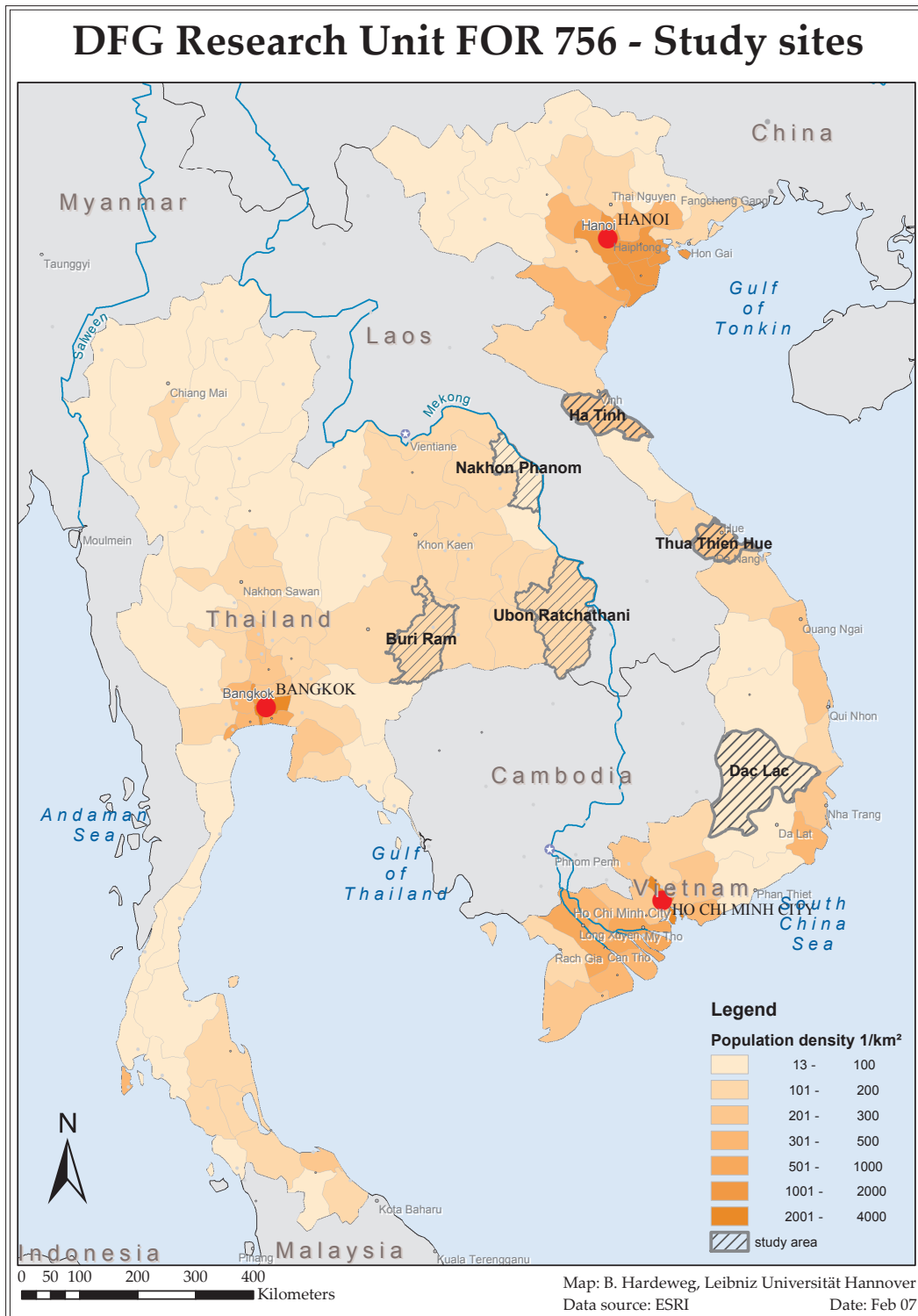
Figure A.1: Study area of the "Vulnerability to poverty in Southeast Asia" survey