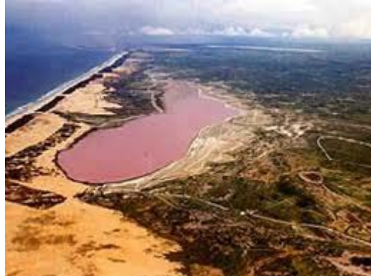
A view of the Pink Lake in Senegal

(superposition of grounded and salted waters). Thanks to its productive ecosystem, the activities organized in the surroundings of the site can take advantage of the full spectrum of mining, terrestrial and marine resources. The activities provide substantial positive contribution and represent a significant portion of the whole coastal economy largely dominated by fishery and mining.