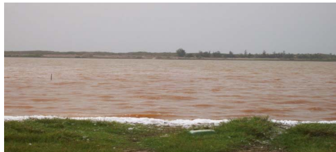
Another view of the Pink Lake

In 1990, the Lake's surface area was estimated to be 4 km 2 ; but only 3 km 2 in 2002. Since then, the area has shrunk dramatically (Breda-Unesco, 2002). Called "salt mine" by the authorities, the Lake is on the UNESCO World Heritage Tentative List-2005 because of its unique pink colour, a natural curiosity 2 .