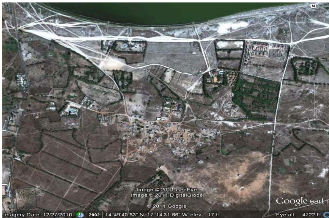
A view of the growing urbanization in the South-West side of the Pink Lake

However, the problem of the laws is that they do not take into account fast enough the various territorial rebuilding and the needs-based organizations (salt diggers, for example). More importantly, their modes of organization as the development of mass activities were most often accompanied by a predominance of national, regional or local economic and social regulations. This reorganization should be inseparable from the productive changes that affect first the salt diggers and then the salt mining companies. The growing importance of the subcontracting issue and the outsourcing of various functions of the extractive companies encourage developing logical site to address issues of employment, remuneration and work.