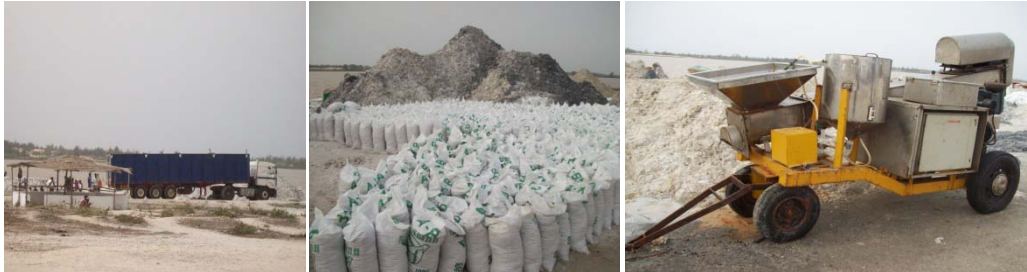
Salt transportation (left), salt bagging (middle) and salt iodization (right)

Har Yalla means "While waiting for God". It is located on the north-eastern bank of the Lake. The name comes from an old salt digger (not native to the area) who first made a straw hut in the immediate surroundings of the Lake in order to make most of the extraction. Subsequently, others have joined him. According to anecdotes, he liked to sit in his hut, during the hot weather period, and said he was waiting for God to deliver the difficult task of extracting that he was doing every day. The place has become an area where large piles of salt are accumulated.