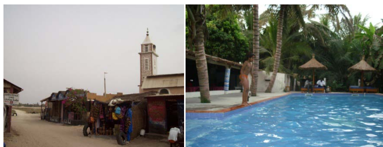
The craft village (left) and one of the hotels around with bungalows and swimming pool (right)

The "Village artisanal", is the French word for "craft village". It is located in the south-western shore of the lake between the fine and white dunes and the old shellfish basin. This is where the camps, hotels, bungalows and commercial art stalls are located. It is also, per excellence, the tourist area of the Lake, with its swimming pools, parking and souvenir shops. It is also where the only paved road connects the Lake to the rest of the country and especially to Dakar and Rufisque.