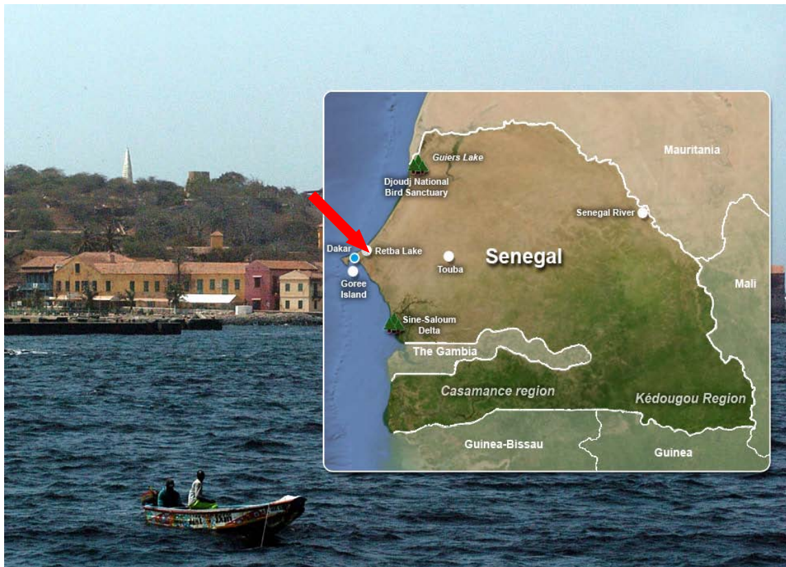
In the back of the map, the Island of Gorée one of the most visited places in Senegal and the map indicates the location of the Pink Lake or Retba Lake (see red arrow) within the country.

The Pink Lake is located in the Northeast of Dakar (along the so-called “Long Coast”) in the rural area, about thirty kilometres from the capital city. It is surrounded by the seaside and the white dunes on its North, East and West and by a conglomerate of villages and new urbanizations on its South. Because of its closeness to the Atlantic Ocean, it can be considered as a LLCA – Low-Lying Coastal Area – as it is a contiguous area along the coastal white dunes (around 2 km from the beach) and is less than 10 meters above sea level. It has a fragile status of ecosystem and many environmental and socio-economic shifts are occurring there due to population dynamics (different types of migrations, settlement, tourism, etc.).