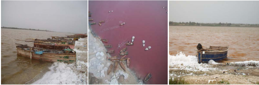
Triangular shape of the canoes employed by the Salt diggers (left: Author's picture 2011; middle: taken in Internet, and right: Author's picture, 2011)

Women are in charge of the canoes ashore. They mostly unload the heavy, wet and black salt from the boats; they are loaders and intermediates. They also pile the salt in the immediate surroundings of the Lake. They are paid 1000 CFA (1, 50 €) by boat to unload the salt. Each unloaded canoe is paid either immediately or after the "salt digger" has sold the whole product which can take several months. In that case all women's activities are registered in a book as a record for further payments. Afterwards, women launder and dry the salt in the sun for four days before the bagging which is done by Kolo-Kolo , men who bag the dried and often grey or white salt after it has been iodised. Thus there is a gendered and sexual division of labour and tasks around the Lake.