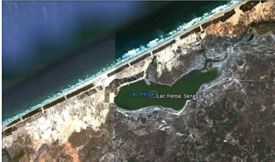
A Satellite view of the Pink Lake, Senegal, Source: Google Earth, 2011

In 1990, the Lake's surface area was estimated to be 4 km 2 ; but only 3 km 2 in 2002. Since then, the area has shrunk dramatically (Breda-Unesco, 2002). Called "salt mine" by the authorities, the Lake is on the UNESCO World Heritage Tentative List-2005 because of its unique pink colour, a natural curiosity 2 .