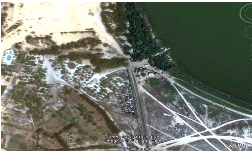
A satellite view of the Hotels and Bungalows in the Pink Lake (West side)

Many villagers from the area adapt to depleting water resources and reduced value of rain-fed cultivated land by selling their land for the construction of houses. The neighbourhoods of growing city of Dakar and the recreational activities of the Lake site have attracted estate companies. Therefore, urbanization and the proliferation of construction pose a threat to the lake’s watershed due to the obstruction of water runoff. In this context, the big confusion about land use policies on the Lake appears to be very problematic (Traoré, 1997). Also, the shells covering the soils of the watershed are used for construction purposes and industry, which could further disrupt the ecosystem of the Lake.