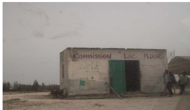
Management Committee’s office in the site of the Pink Lake

The role of the M.C., in fact, is to everybody benefit from the gradually obtained achievements, but also to give workers a framework of thought and action. It is not a conscious and controlled direction for the destiny of the workers, but it helps to manage the risks rather than controlling them. So the action of the M.C. varies according to experiences and knowledge it has of the different situations prevailing on the Lake’s site; then far from the natural constraints and socio-cultural routine. Decisions are part of a long dynamic process of self-construction; which implies most of the time to look at and interpret what is around them (hence the immediate environment) and act. One must however consider the M.C. as an institution that excels in a social practice which is a function of intense socialization (a kind of policy instrument) playing a significant role in the economic and social life of the Lake.