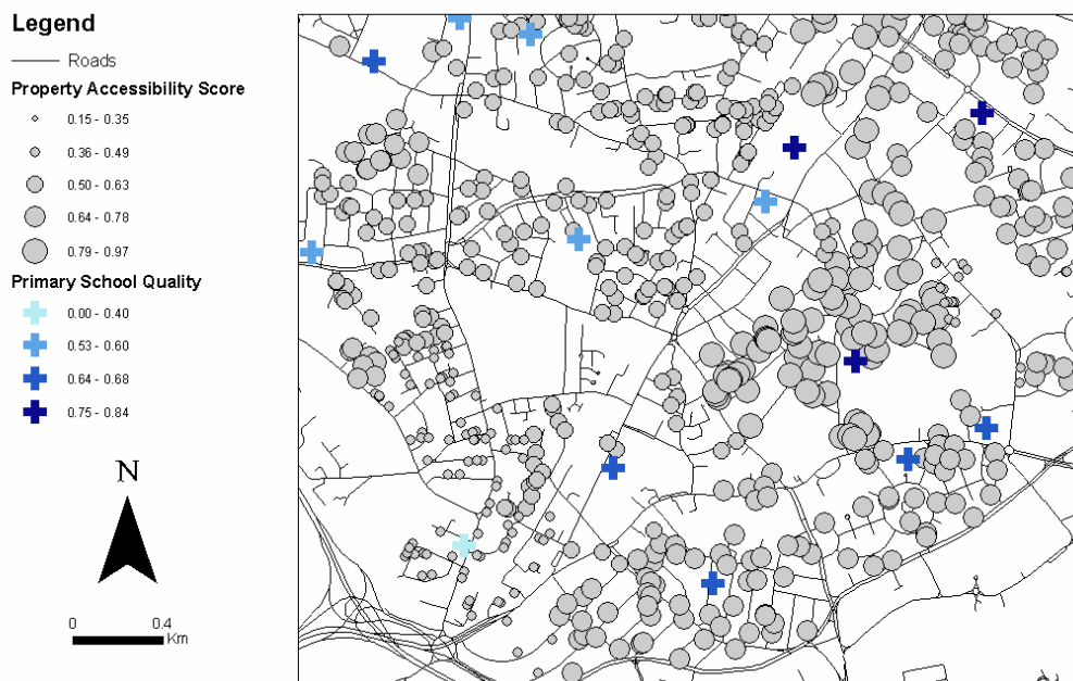
Figure 1: Primary School accessibility scores for a selection of properties

Using a GIS, data on land uses and the location and orientation of each property was combined with information on the landscape topology and building heights to calculate indices describing the views available from each property. View indices were constructed for recreational parkland and water surfaces.