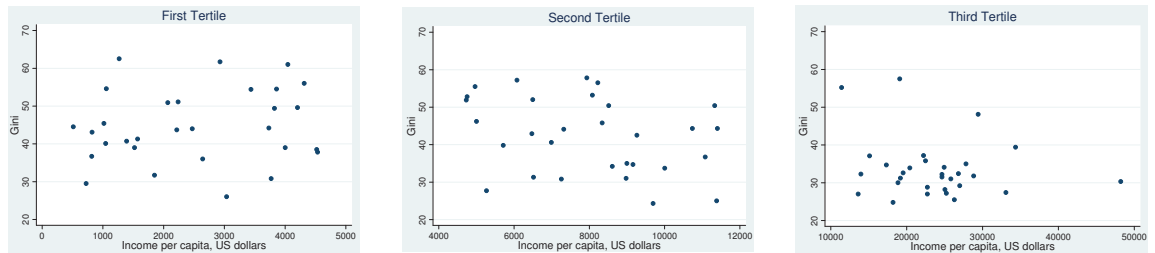
Figure 2: Gini and income per capita for different tertiles of income per capita

The Appendix to descriptive statistics contains a thorough description of the main variables and the prediction according to the literature. Table 8 in the Appendix presents a brief