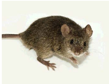
Figure 1: Picture of a mouse as presented in the instructions of the experiment.

unsuited for study. They were perfectly healthy, but keeping them alive would have been costly. It is standard to gas such mice. This is common practice in laboratories conducting animal experiments. Thus, as a consequence of our experiment, many mice that would otherwise all have died were saved. Subjects were informed about this default in a post-experimental debriefing. 5