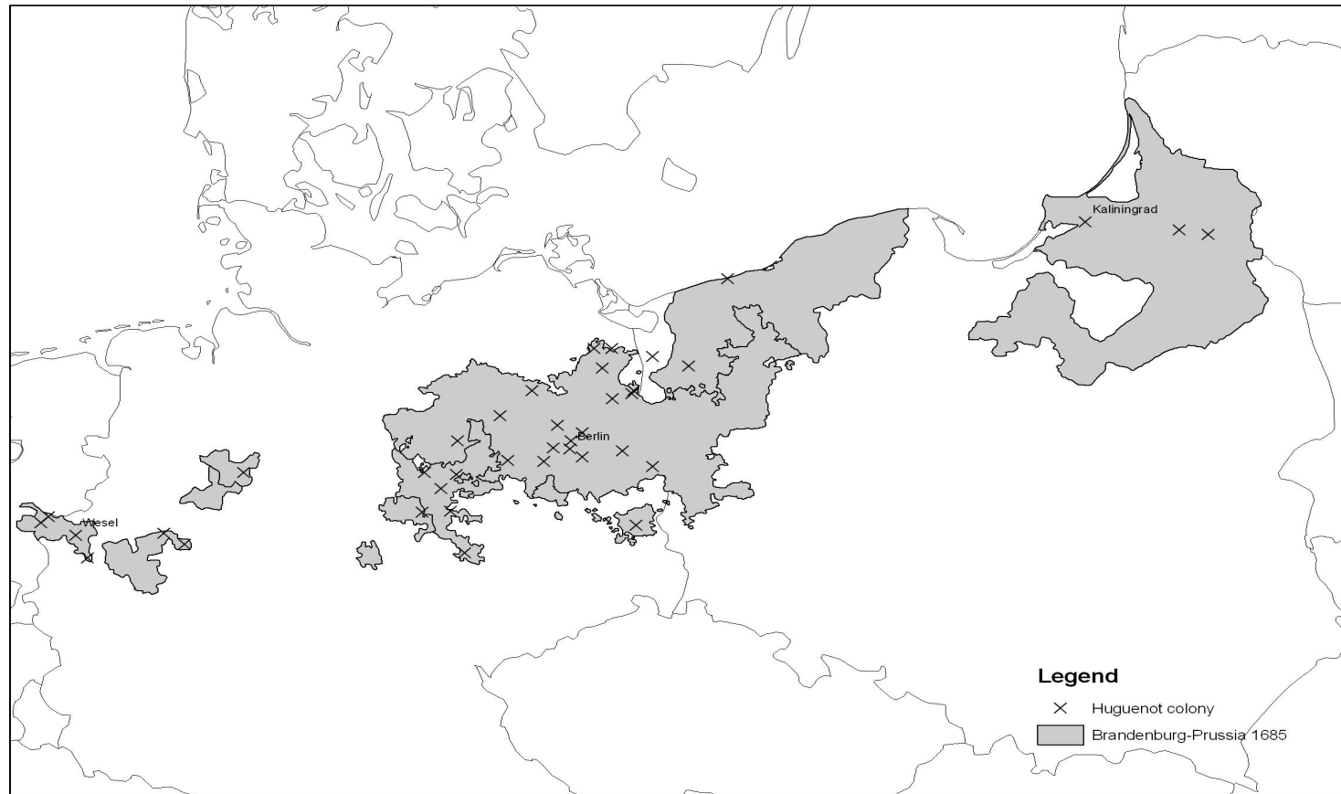
Figure 1: Towns with Huguenot Colonies in Prussia, 1685-1795

The Map shows the territory of Brandenburg-Prussia at the time of the Edict of Potsdam in 1685. Urban Huguenot colonies that were founded after 1685 are marked by a cross. Source: Own illustration; see main text for details.