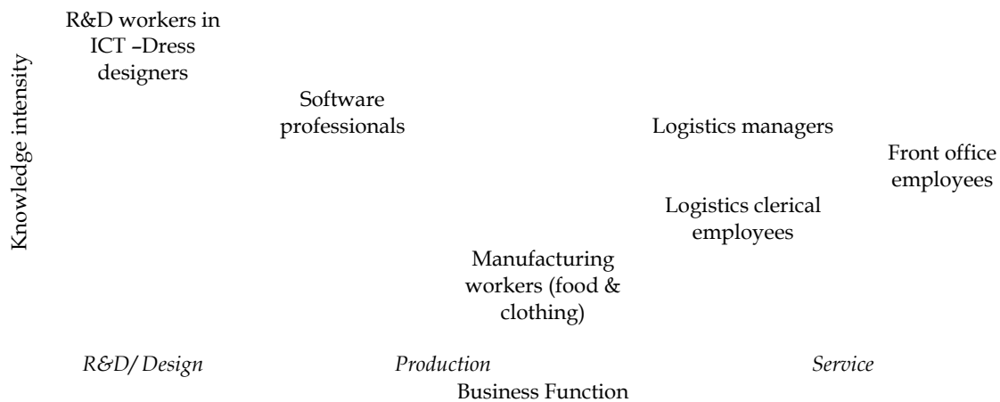
Figure 9.1 Clusters of occupational groups

The first cluster includes knowledge-based (creative) occupations . It consists of R&D workers in ICT, designers (fashion designers and technical designers), and software professionals. 17 There are several common aspects among those occupational groups, who can be characterised as creative knowledge-based workers, as far as creativity is understood in a broad meaning: aesthetical creativity, technical creativity, generation of IT knowledge.