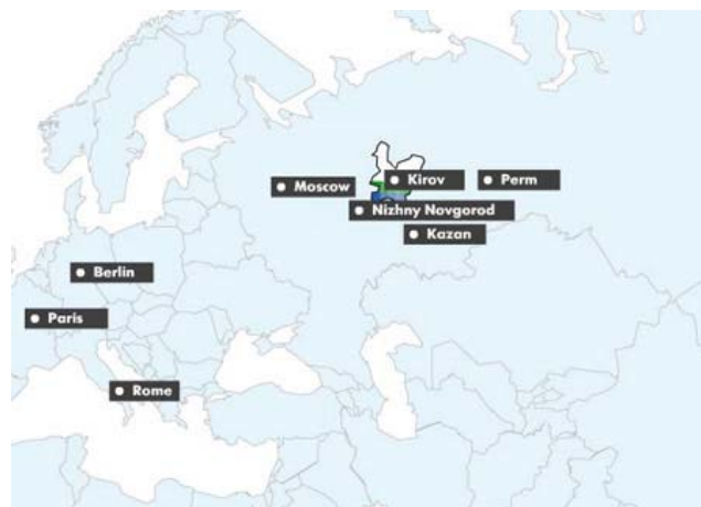
Figure 1. The Kirov region.

The agro industrial complex presents a considerable share in the economy of the region (about 11% of the region GDP) with 7,2% of the economically active population. There are about 2 thousand agro industrial and farming enterprises. The main activities are flex and crop production and processing, milk processing, animal breeding.