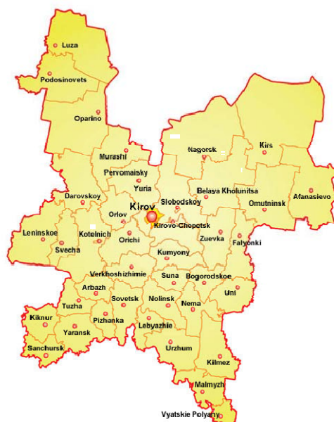
Figure 3: Administrative division of the Kirov region.

The following ranking results have been received. The top six municipal districts for the development of rural tourism are Kymyony (6,625), Kotelnich (6,150), Sovetsk (6,150), Nagorsk (6,100), Urzhum (5,750) and Slobodskoy (5,600). They are situated not far from the city of Kirov, there are railway and bus services between Kirov and these areas. These areas also have