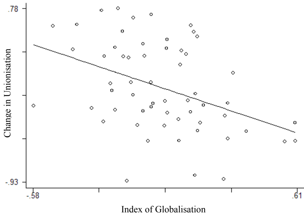
Figure 2: Change in Unionisation and Social Integration, Partial Leverage Plot