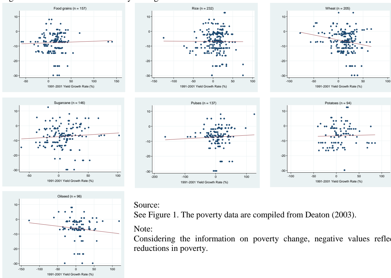
Figure 2: 1993/94-1999/00 Poverty Change vs. 1991-2001 Yield Growth Rate