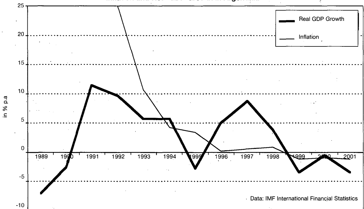
Figure 1 Inflation and Real GDP Growth in Argentina

The introduction of the currency board was coupled by the liberalisation of foreign trade, deregulation, privatisation and a reform of the financial system. A trade reform was pursued to reduce distortions and to integrate the economy with the world markets. Export tariffs and nontariff import barriers were almost eliminated by the end of 1991. With deregulation, the government abolished all price controls, removed barriers to entry in wholesale and retail trade and relaxed regulated access to professional services. From 1991-1994 the Argentinian government privatised some 90 % of all state enterprises for the equivalent of more than US$ 20 bn. The privatisation brought about considerable gains in economic efficiency together with a reduction of employment in this sector. The transformation of the financial system improved banking and financial intermediation. In order to avoid financial crises, banks' reserve requirements and capitalisation ratios were lifted. Financial markets were liberalised, eliminating the discrimination of foreign investors, banks and firms. As a result of these reforms, real GDP-growth was 5% p.a. on the average during 1991-1998 (see Figure 1).